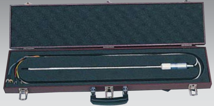
Super Stable Standard Platinum Resistance Thermometer