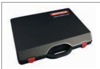
931-22-100 Optional Carrying Case